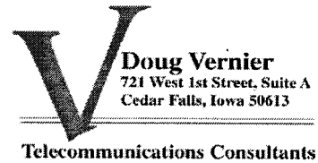
EXHIBIT #1 ENGINEERING STATEMENT

Concerning the Application of 1400 Inc. To Build an FM Translator Station at Hinckley, Minnesota